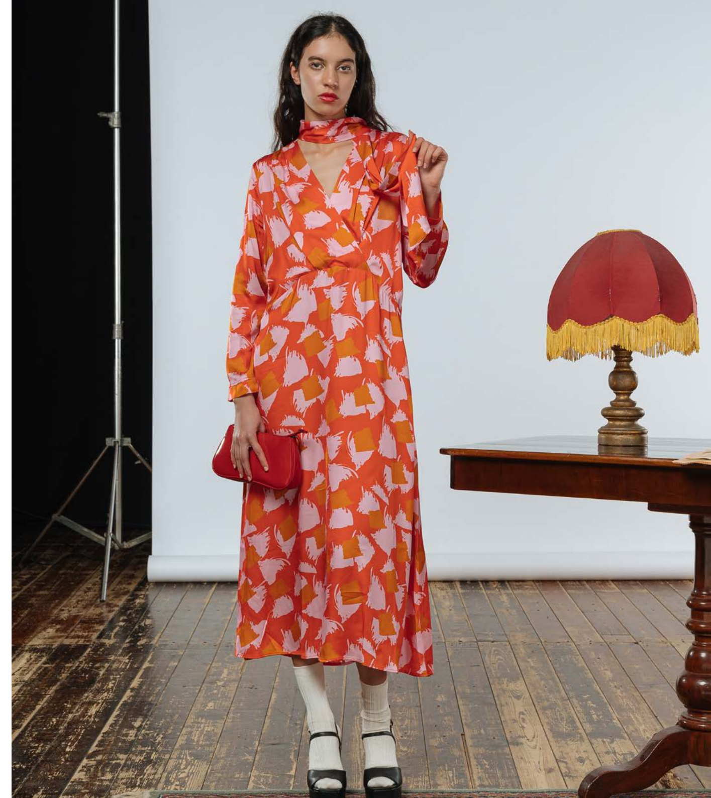
ANJA DRESS VAR. PINK/RED PETALS 100% VISCOSE