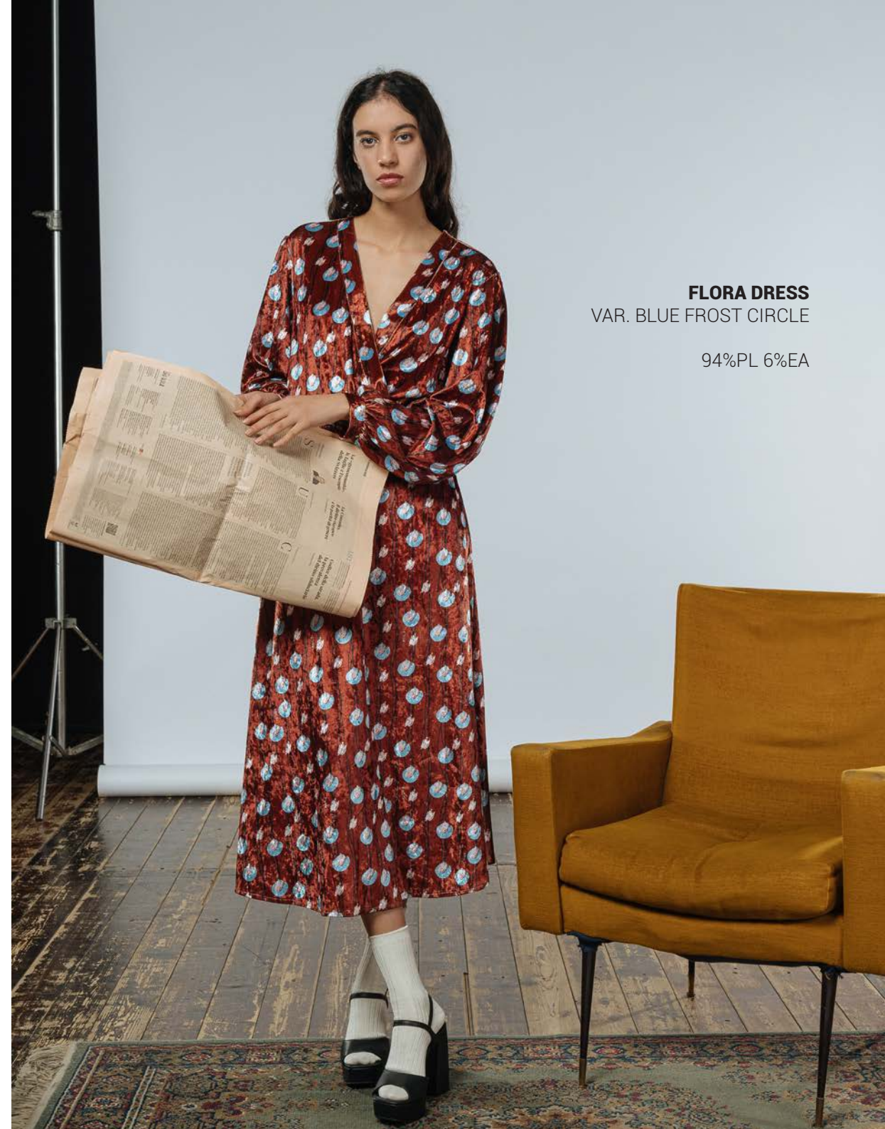
FLORA DRESS VAR. BLUE FROST CIRCLE