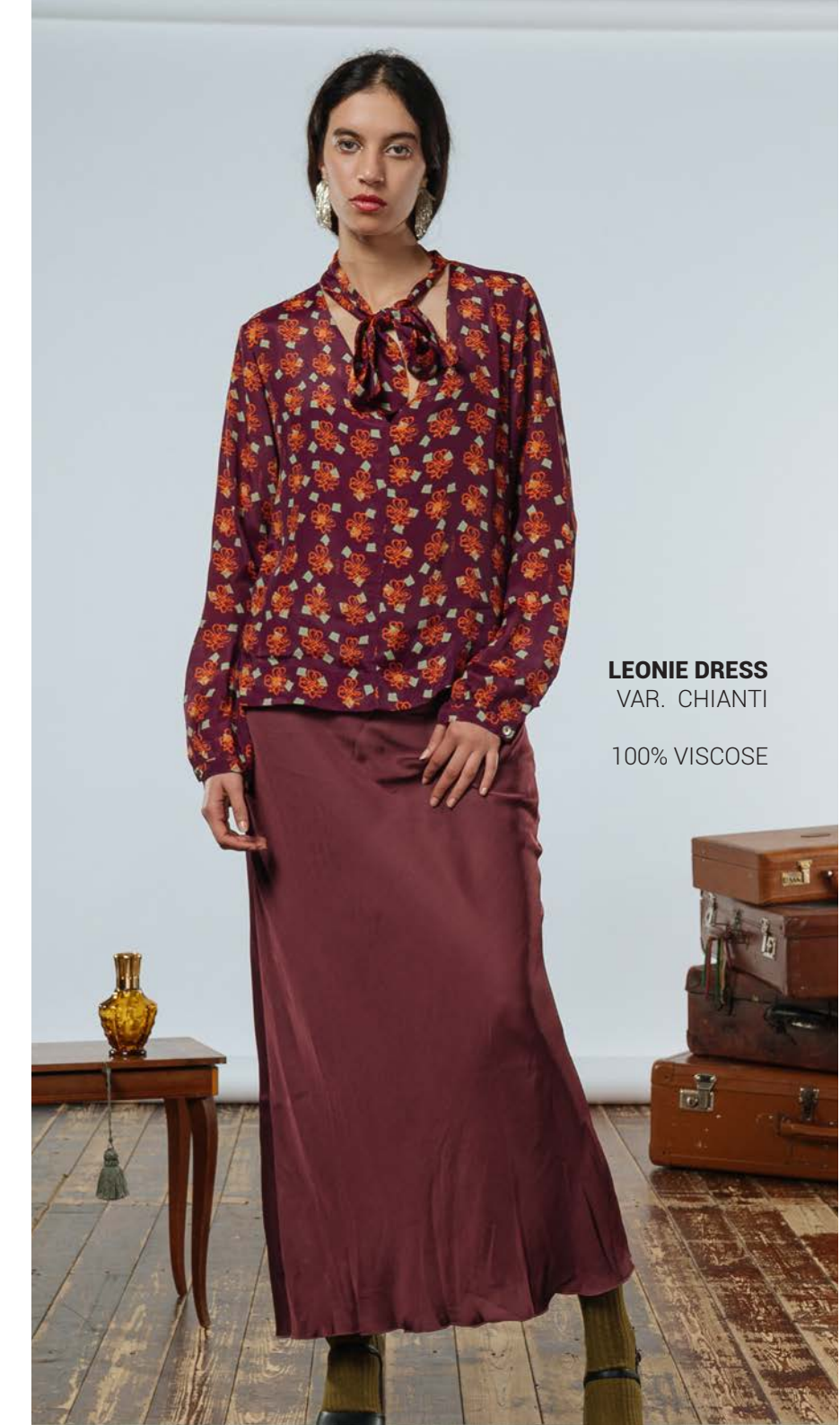
LEONIE DRESS VAR. CHIANTI 100% VISCOSE