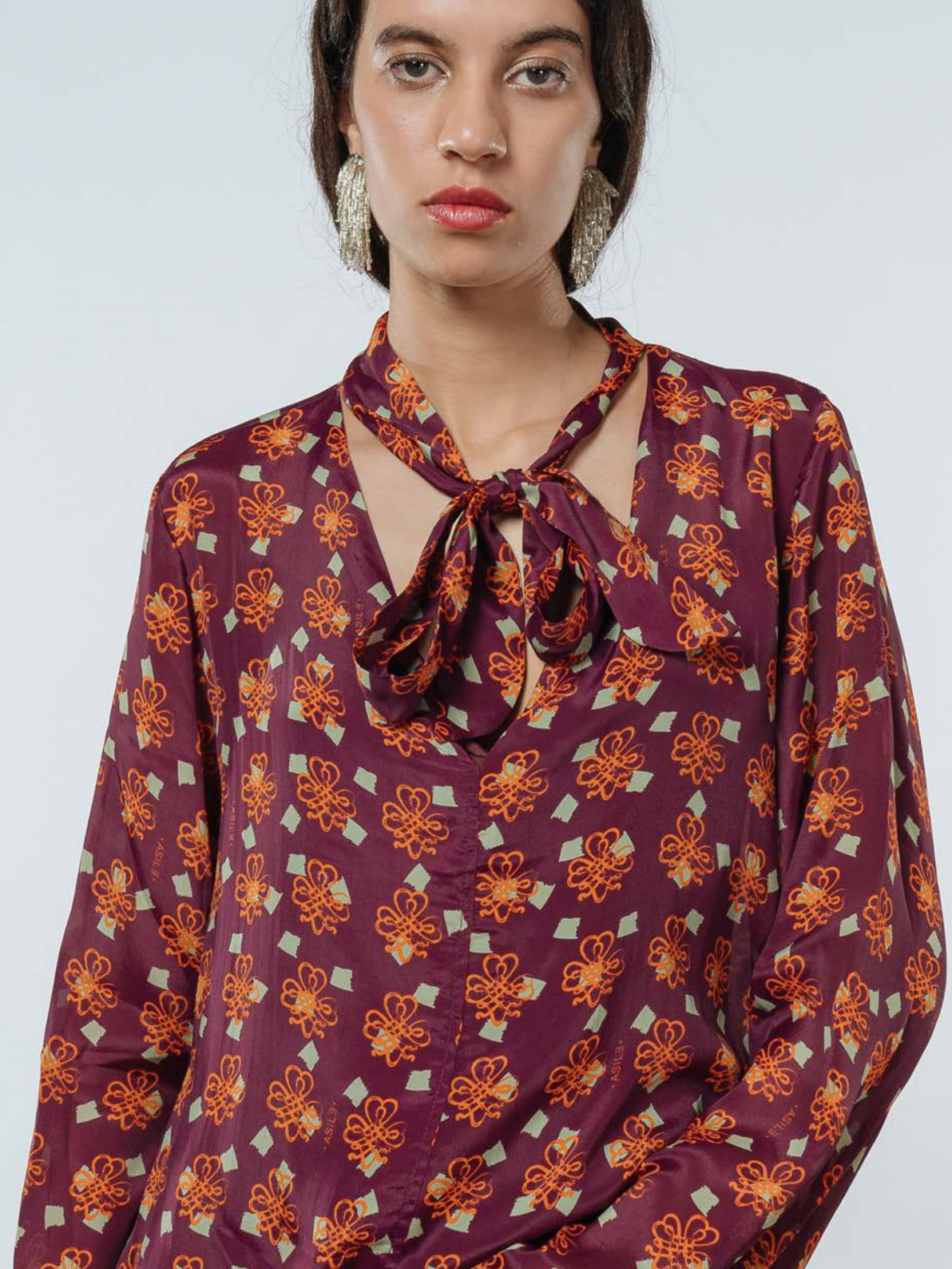
CLARA BLOUSE VAR. BURNT ORANGE LILIES 70% VISCOSE 30% SILK