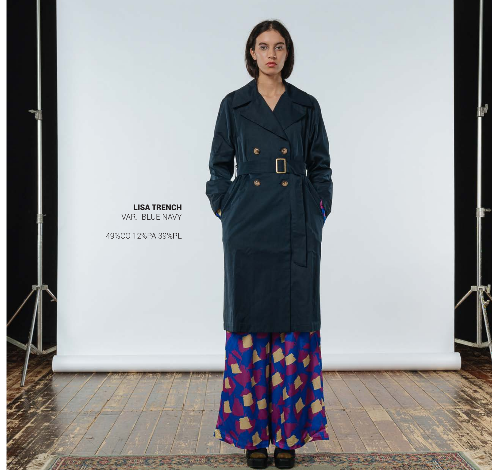
LISA TRENCH VAR. BLUE NAVY 49%CO 12%PA 39%PL