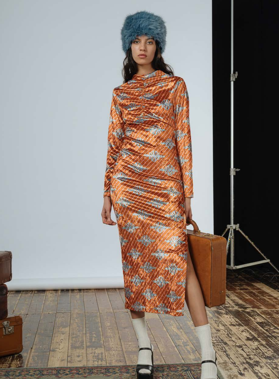
ALINA DRESS VAR. VAR. BLUE FROST FLORAL 94%PL 6%EA