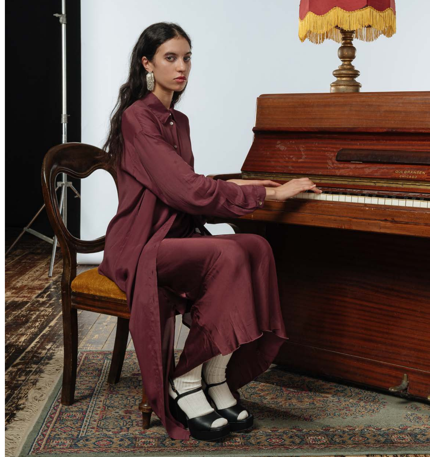
LEONIE DRESS VAR. CHIANTI