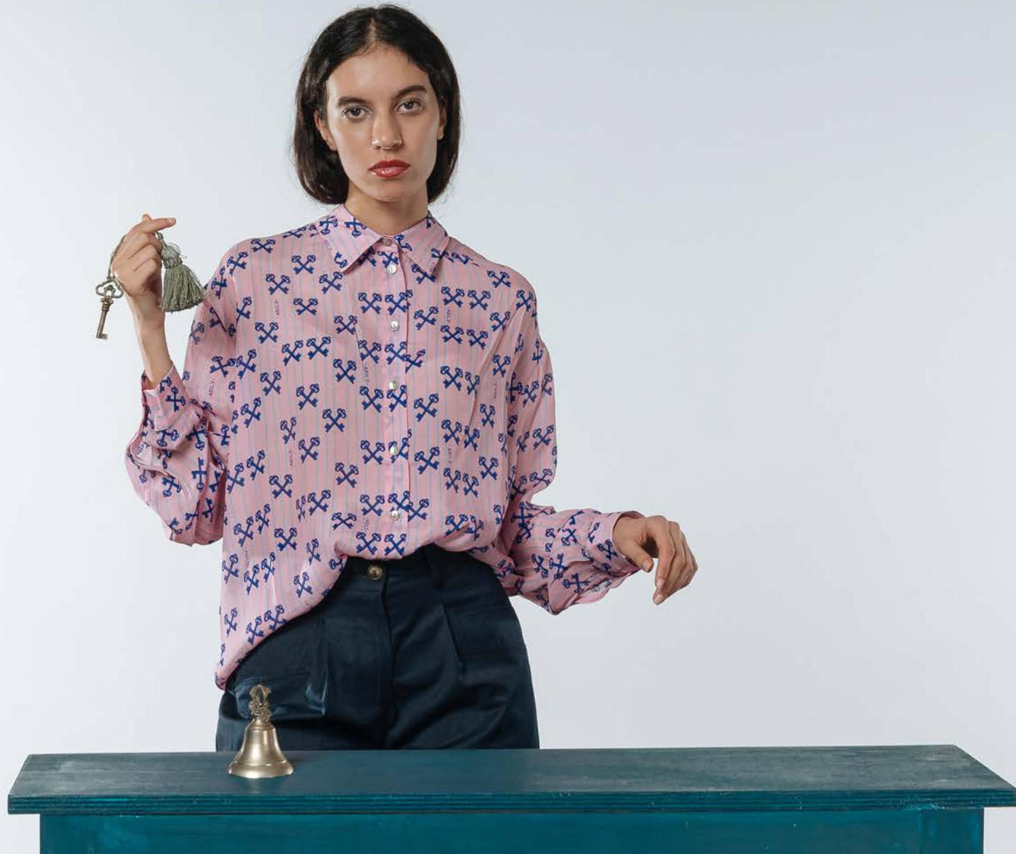
NINA BLOUSE VAR.BLUE KEYS