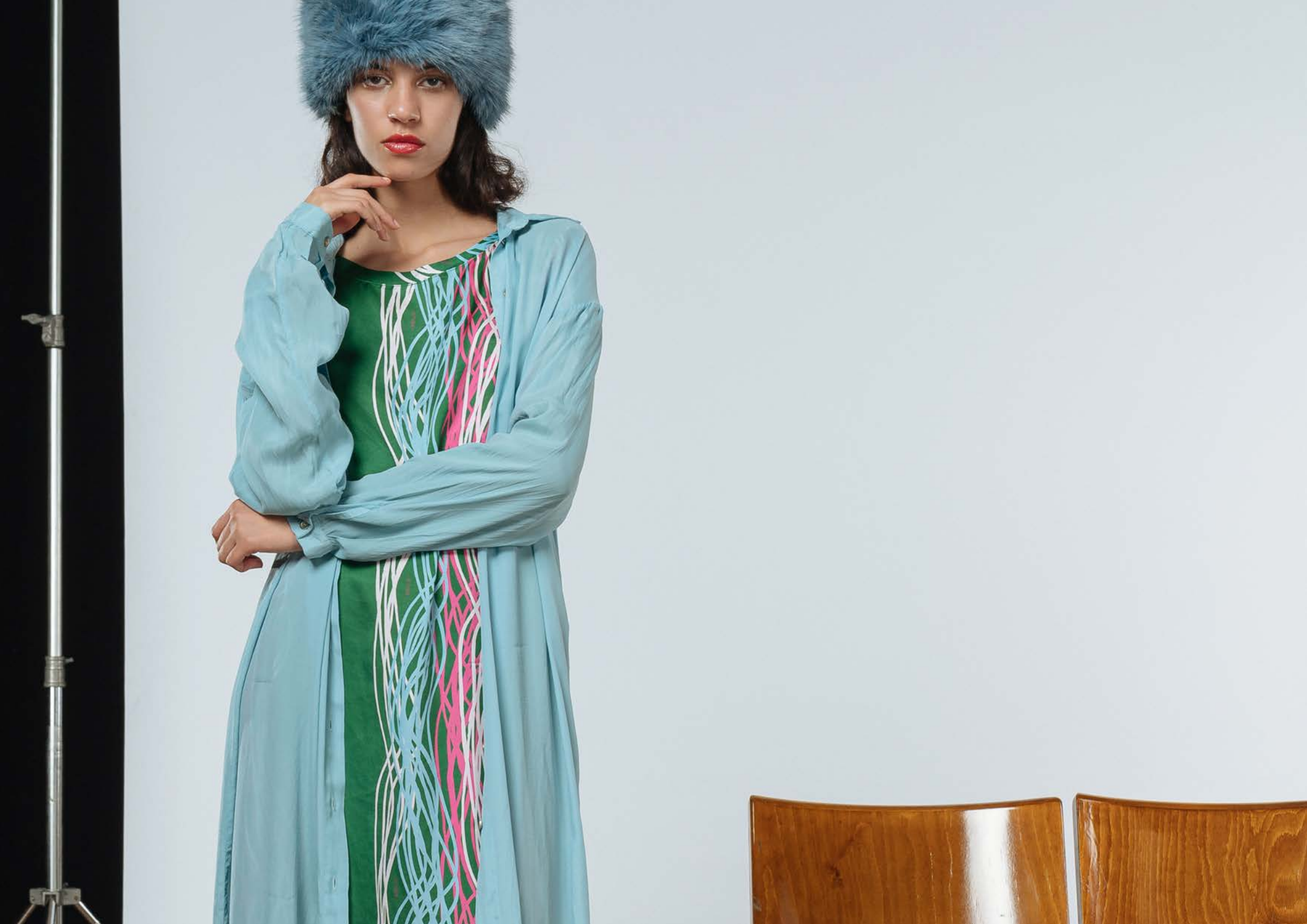
LIA DRESS VAR. STRINGS IN GOLF GREEN 100% VISCOSE