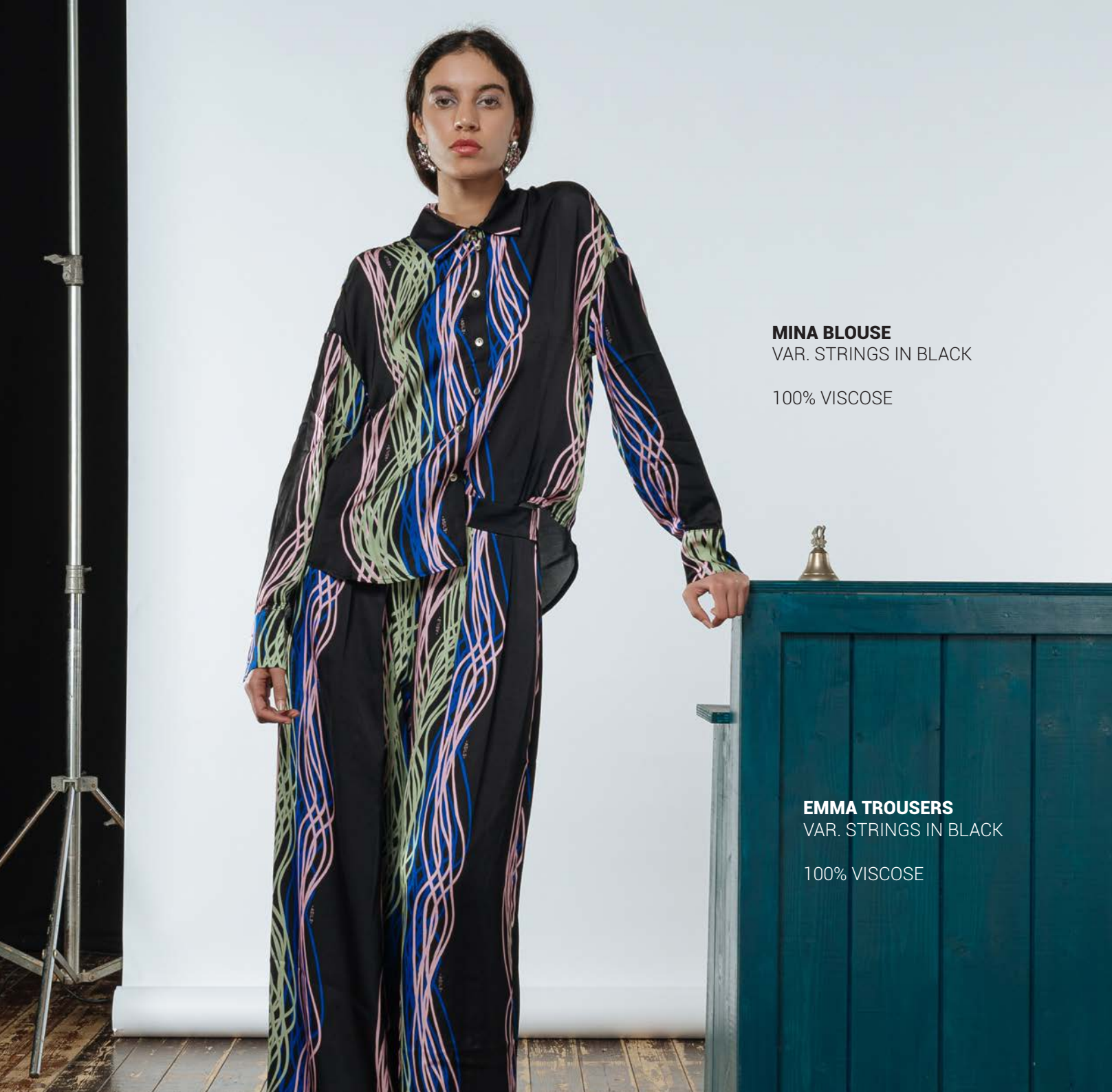
MINA BLOUSE VAR. STRINGS IN BLACK