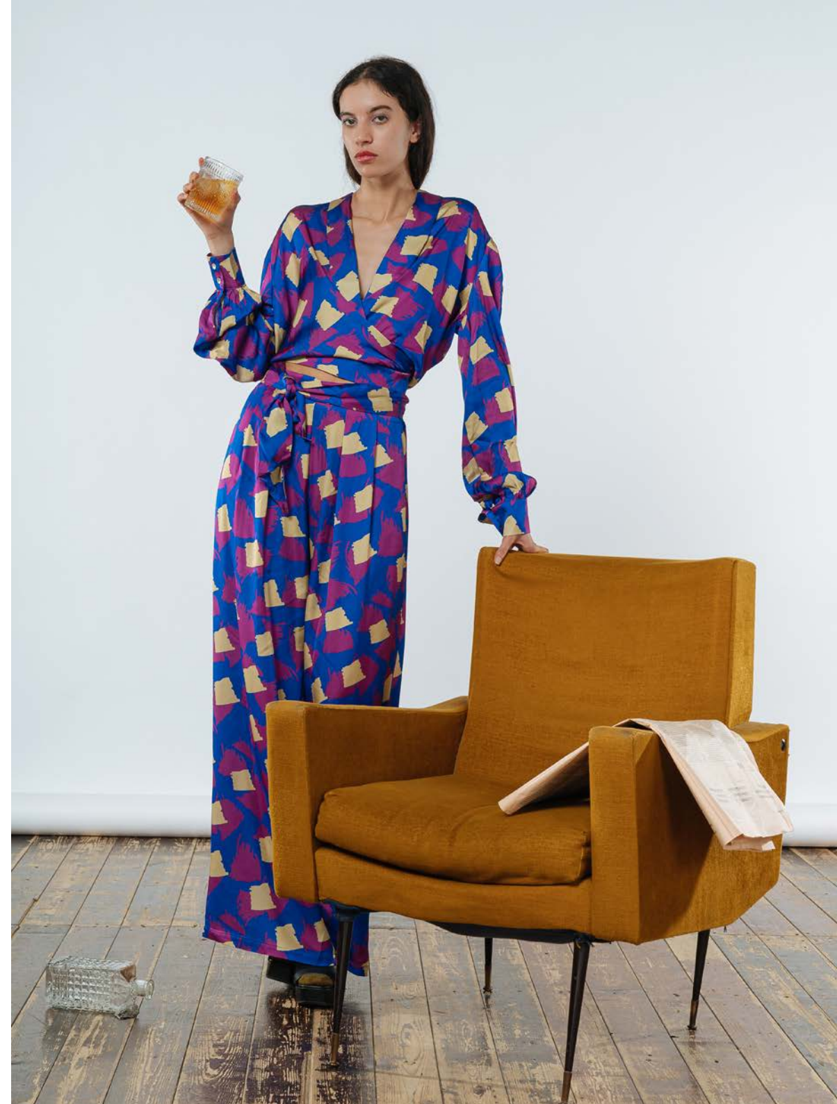
JANA TOP VAR. PURPLE/BLUE PETALS