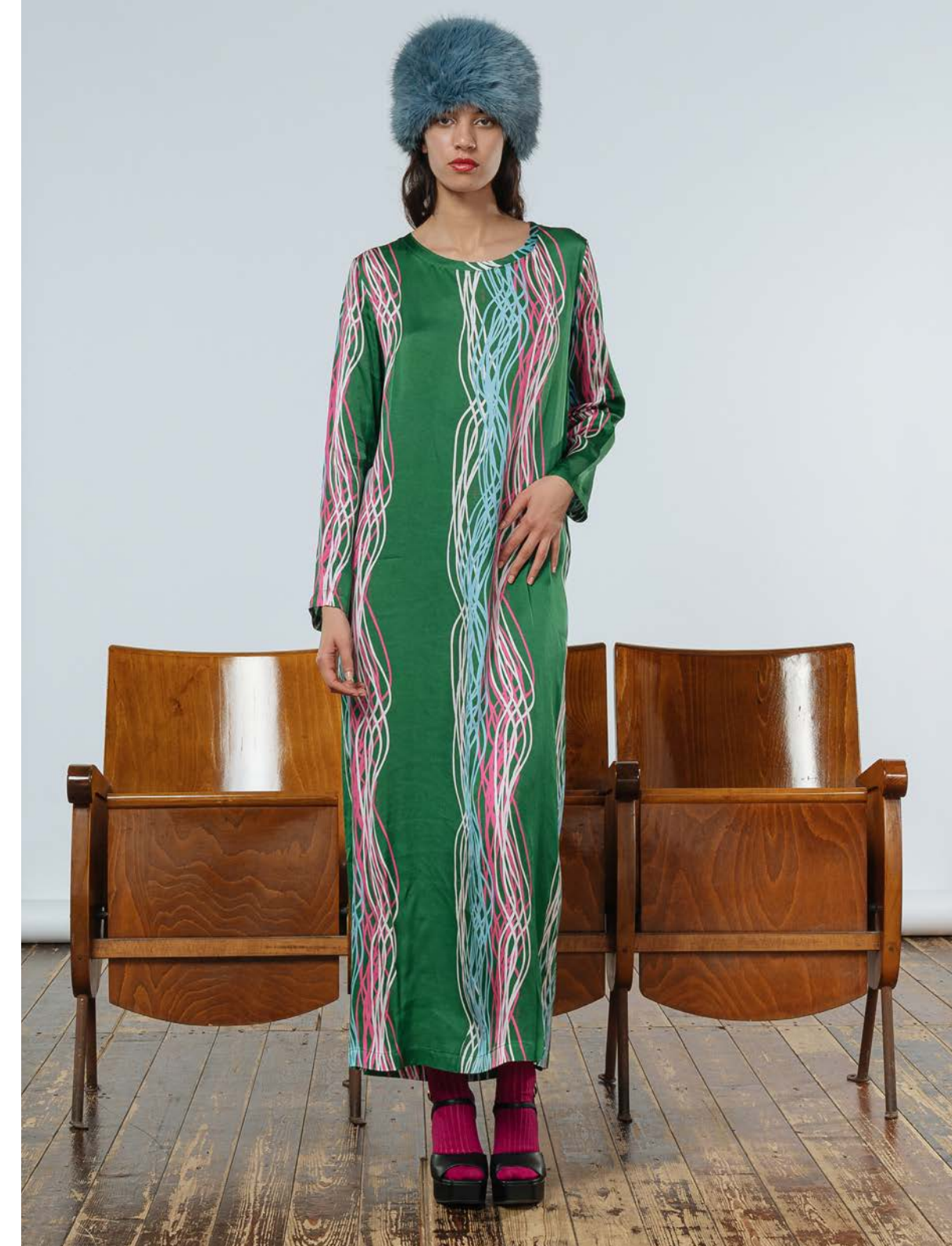
LIA DRESS VAR. STRINGS IN GOLF GREEN 100% VISCOSE