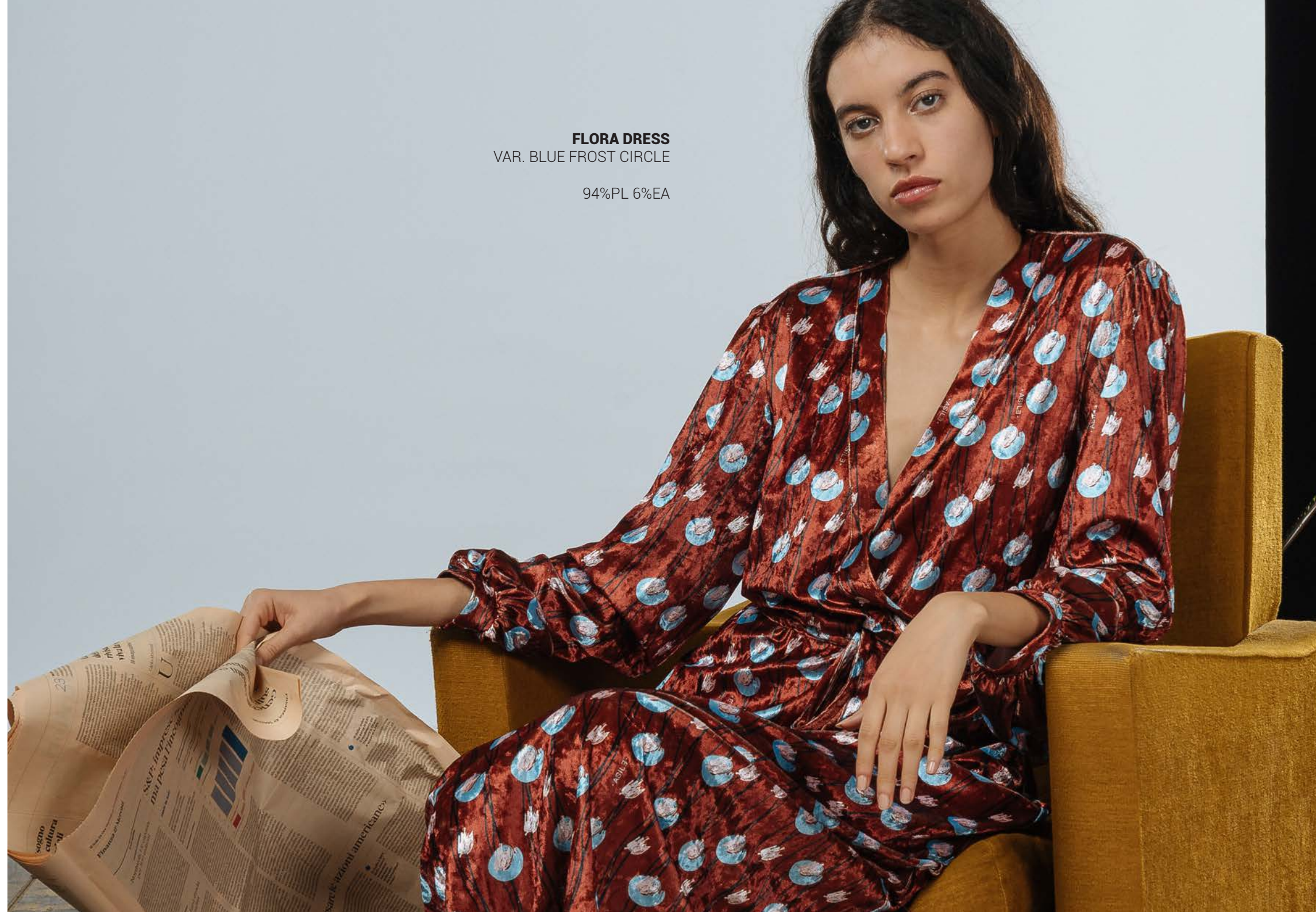
FLORA DRESS VAR. BLUE FROST CIRCLE

The collection is designed for a woman who loves the elegance of times past but lives with her eyes set on the future. The chosen fabrics—viscose, viscose satin, georgette, and chenille—offer comfort and lightness, shaping harmonious silhouettes. The knitwear, the heart of the line, enhances the beauty of the garments with fine yarns such as mohair, cashmere, and wool, enriched by jacquard details that add warmth and character.