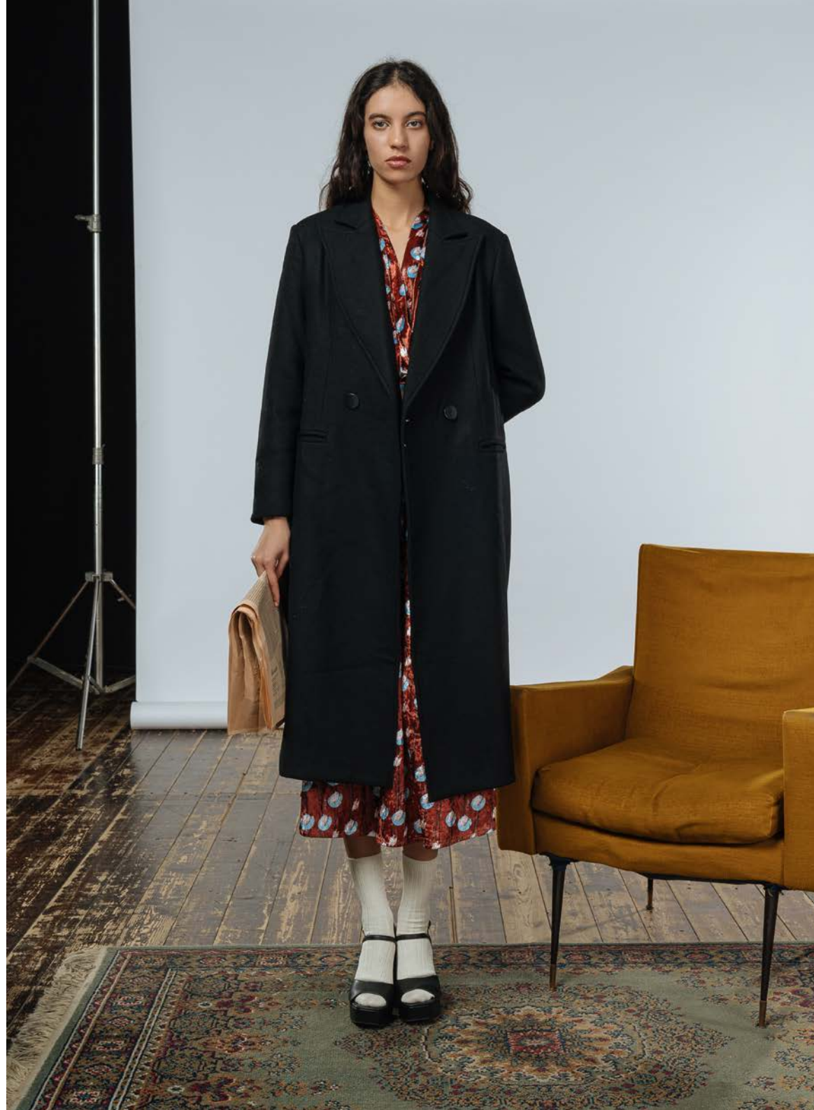
FLORA DRESS VAR. BLUE FROST CIRCLE