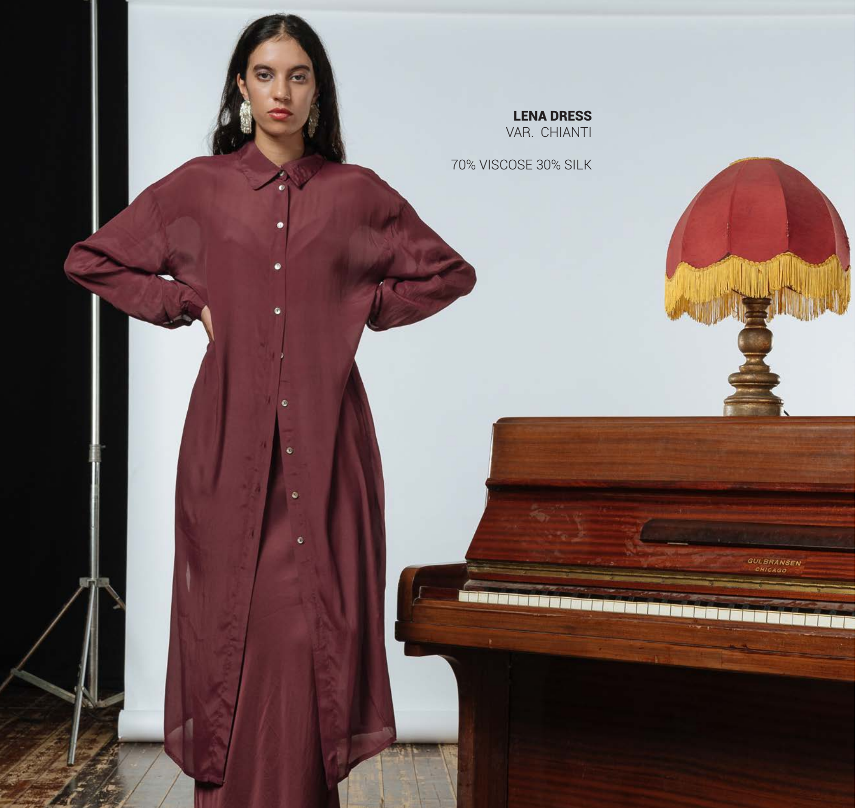
LENA DRESS VAR. CHIANTI